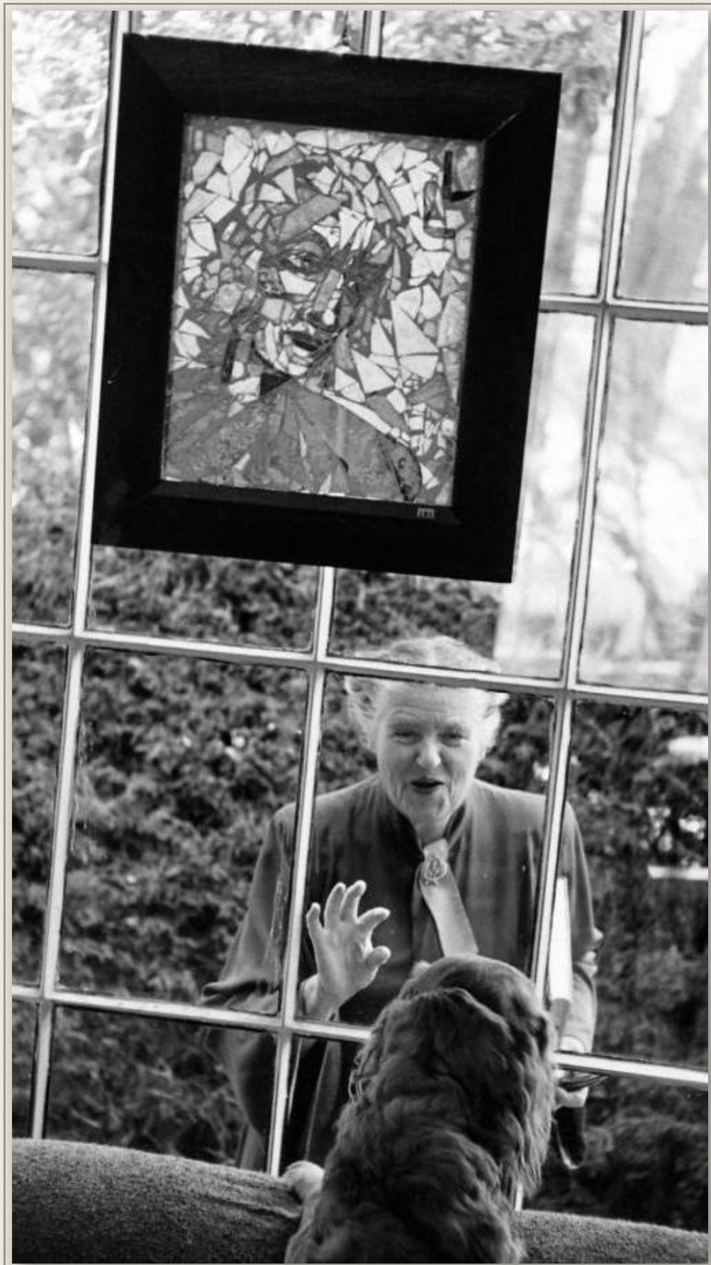
Two of LL's loves in one photo.