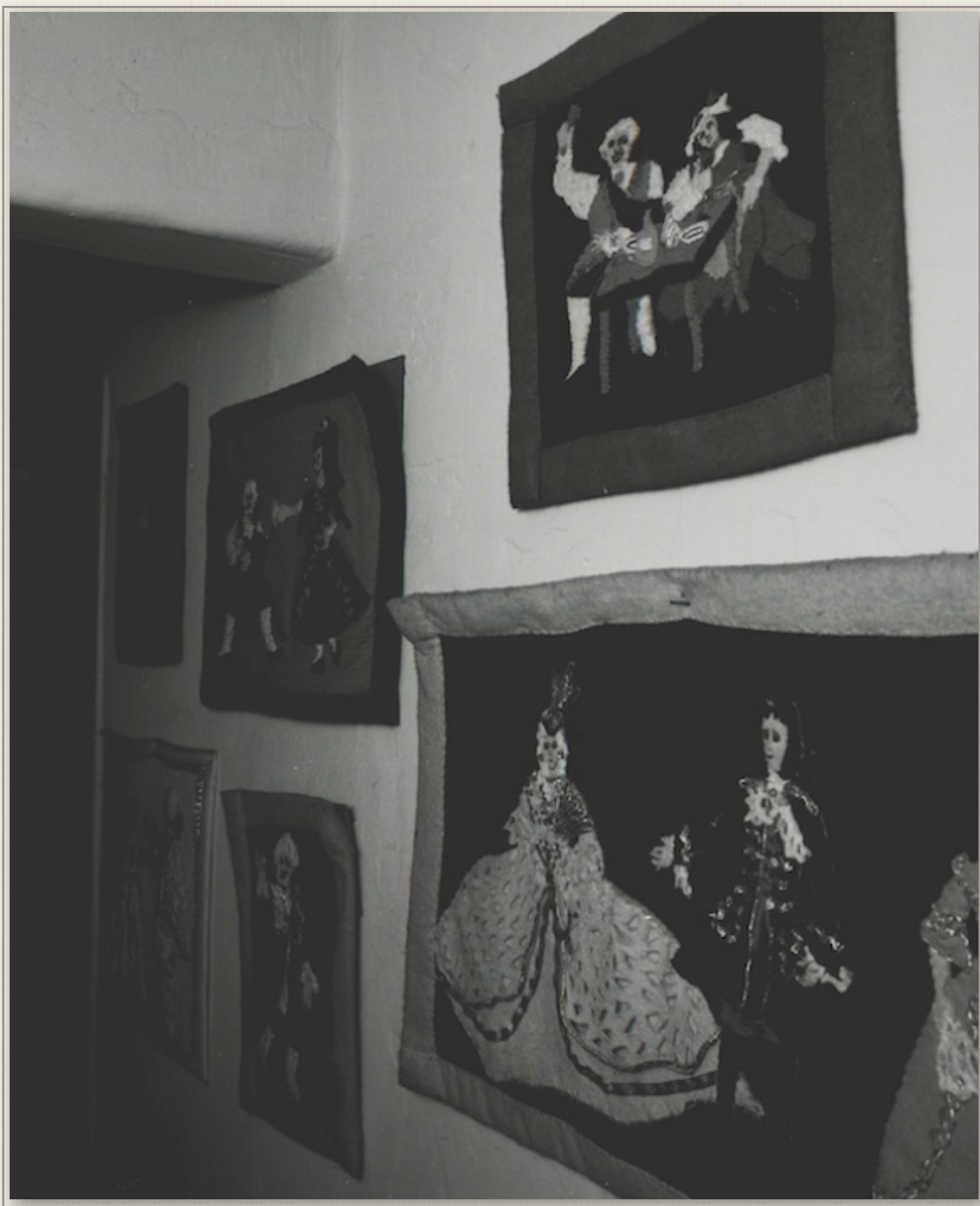
Sadly there is only this black and white photo of LL's Rosenkavalier felt appliques.