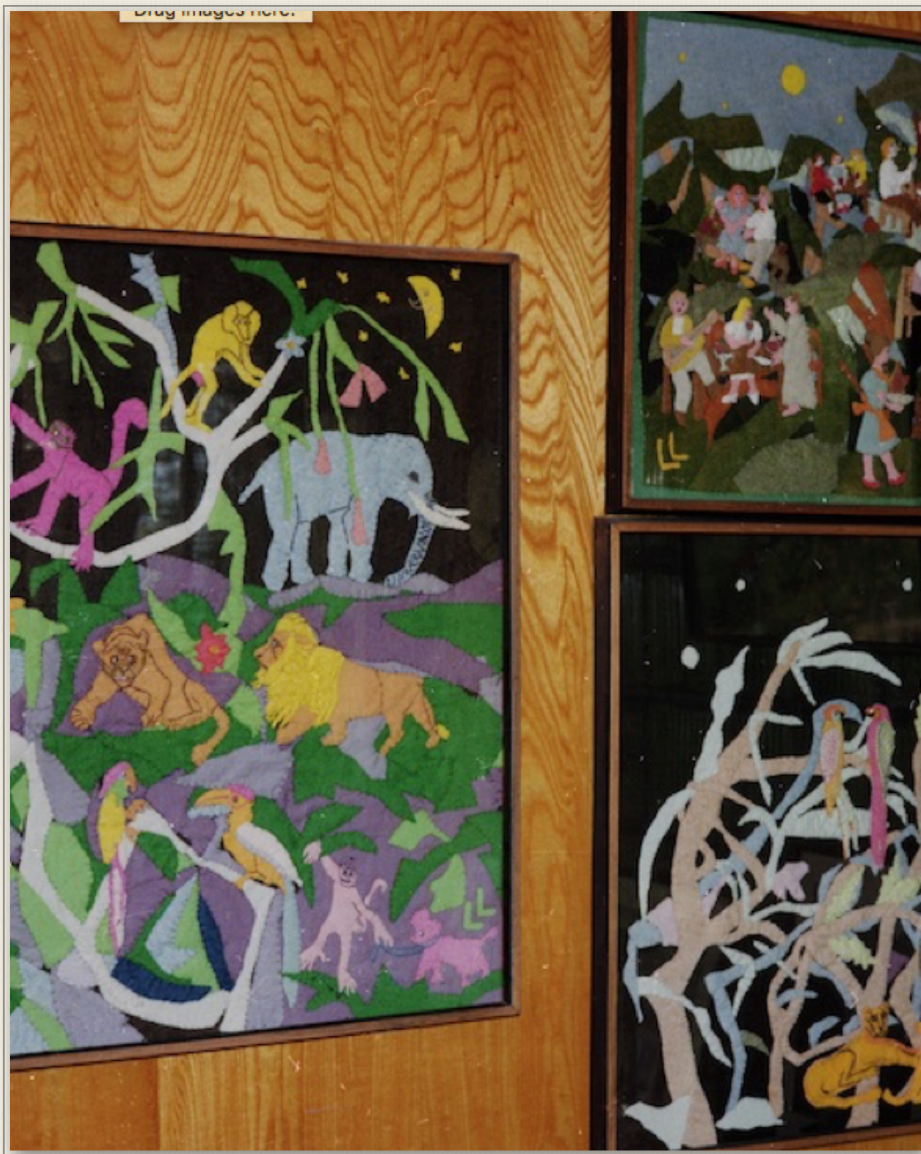
The walls of Orplid were covered in the many styles of art that LL enjoyed working in.