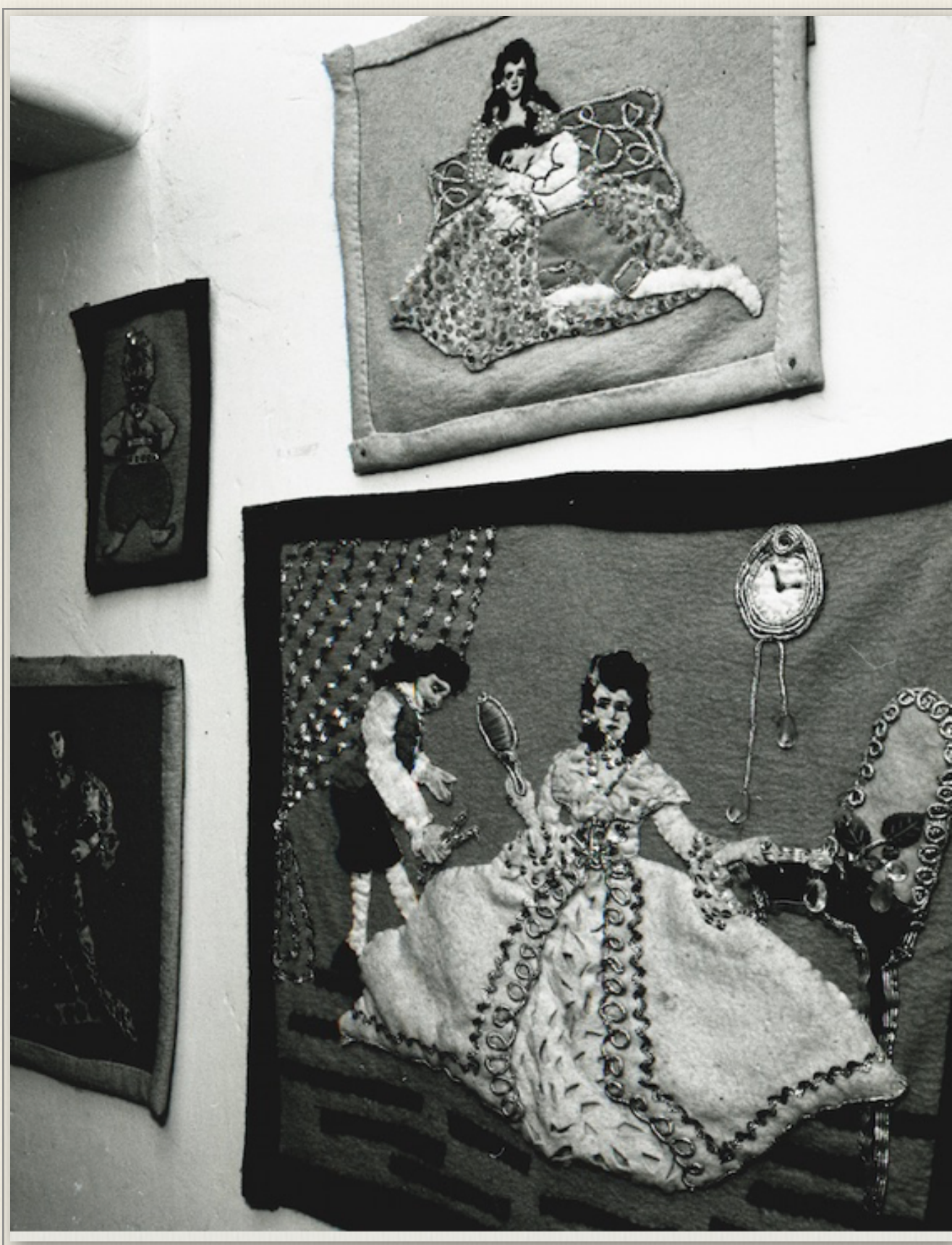
Another corner, another set of Rosenkavalier appliqués.