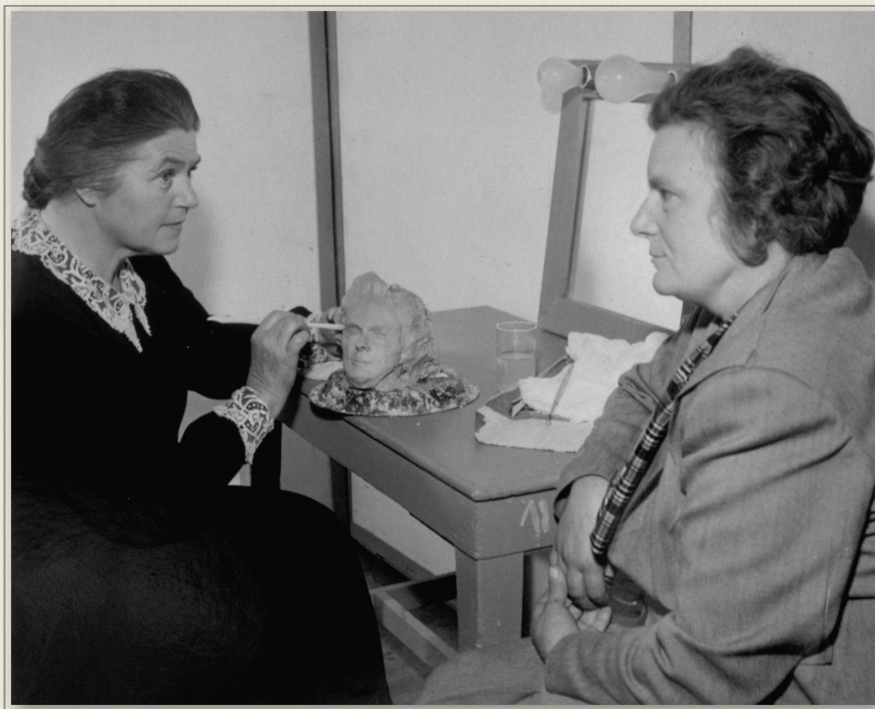
During one of the breaks while filming Big City , LL sculpts a head of Frances.

When I visited Lehmann's and Holden's home, Orplid, I was always aware that art was being produced and exhibited right there. We were surrounded by many aspects of Lehmann's artistic endeavors. I thought it appropriate to show photos of exactly how her art occupied their living quarters.