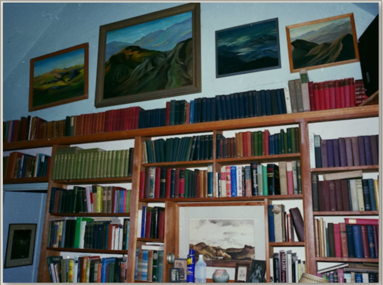
Above the books hang LL landscape paintings.