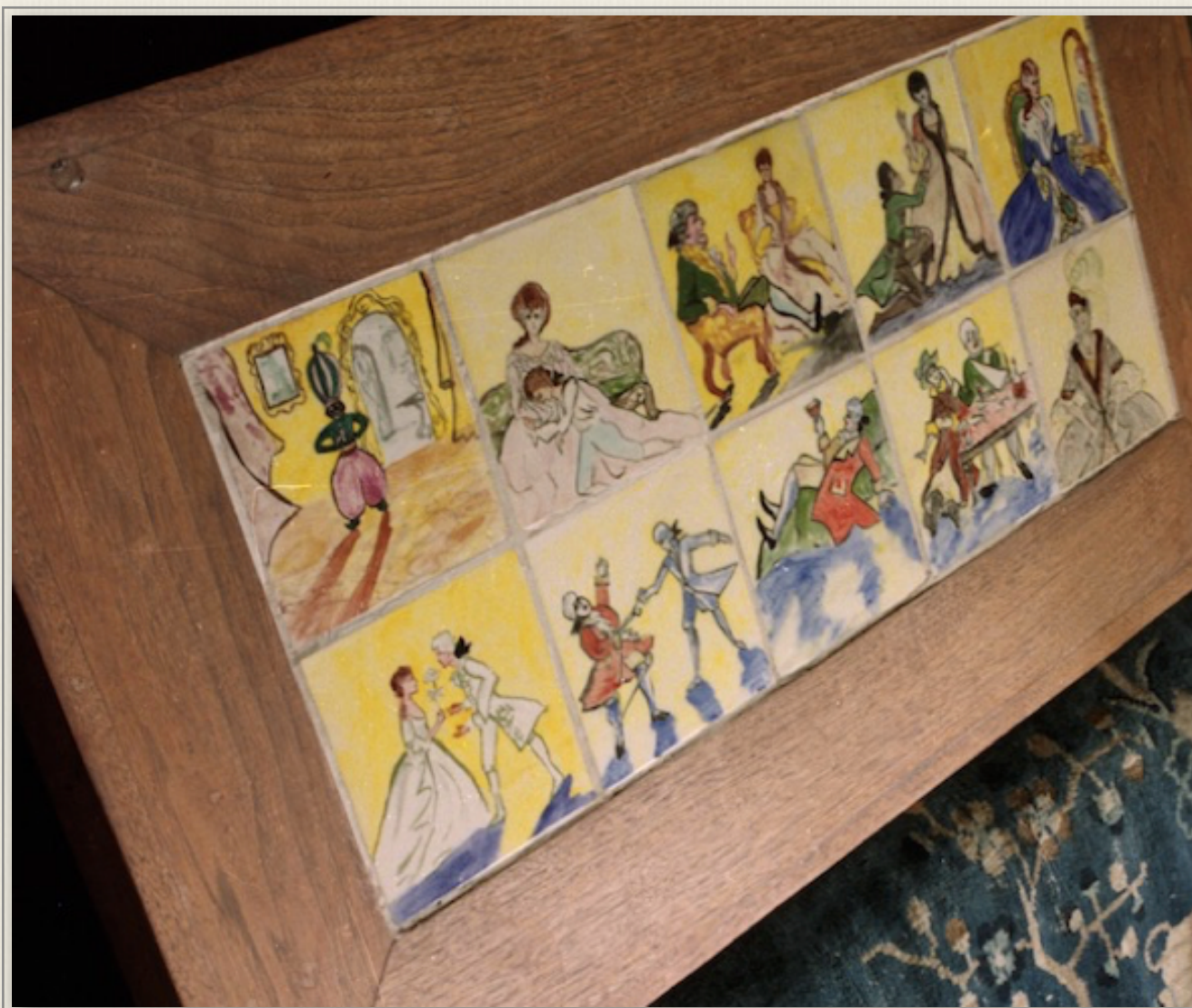
A table top of Rosenkavalier tiles.